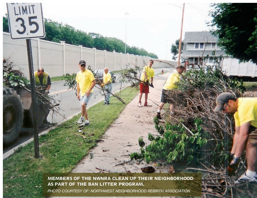
MEMBERS OF THE NWNRA CLEAN UP THEIR NEIGHBORHOOD AS PART OF THE BAN LITTER PROGRAM.