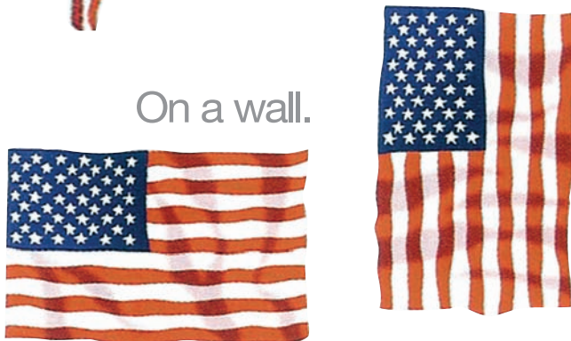
On a wall.