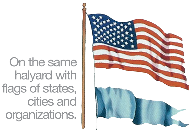
On the same halyard with flags of states, cities and organizations.