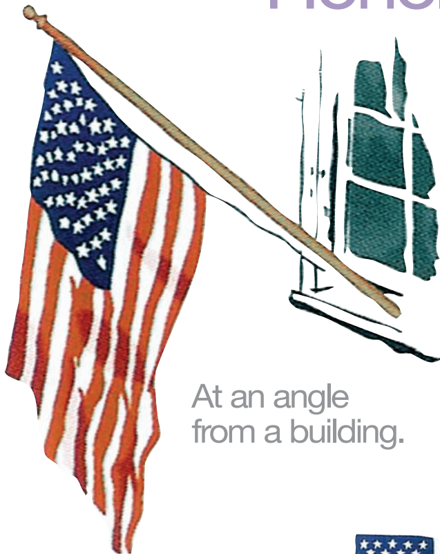
At an angle from a building.

As you see the stars and stripes displayed around town, or if you wish to fly your own flag, keep in mind these rules* that will help to properly show your patriotism to our nation.